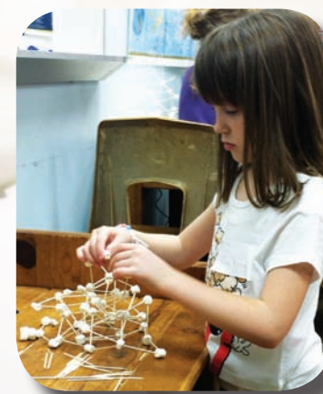
Making a molecular model at a Greensboro elementary school during science night.

The University of North Carolina (UNC) Morehead Planetarium and Science Center is using this five-year grant to support the North Carolina Science Festival Capacity-Building program. New initiatives include better communication through a new website and use of social media. The Center also has hired a festival director, development and communications officer and other staff, who have attracted 18 sponsors for the 2012 North Carolina Science Festival. The festival is a 16-day statewide series of events showcasing STEM with hands-on activities, science talks, lab tours, nature experiences, exhibits and performances, including hands-on demonstrations.