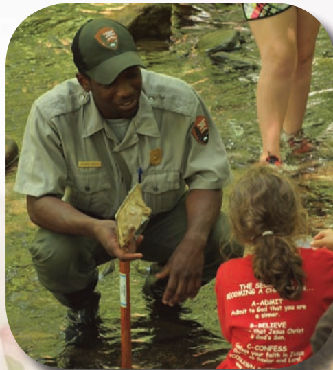
A science intern assists a student in the Great Smoky Mountains National Park.

High school science interns from Swain, Graham and Haywood counties get hands-on experience with real science projects in the Smokies, including a chance to work directly with scientists from inside and outside the park. The park's nonprofit Friends of the Great Smoky Mountains National Park will use the Ribbon of Hope grant to expand the internship program. The program targets 600 students and teachers.