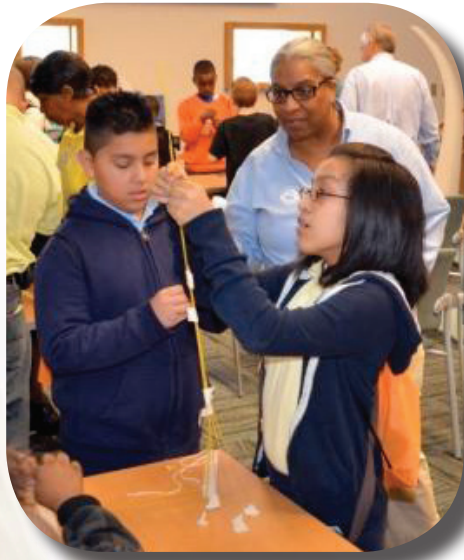
N.C. CAP Statewide Youth STEM Summit at the N.C. Museum of Natural Sciences.

The hours after school are when students are most at-risk for juvenile crime and gang activity, getting into car accidents, or experimenting with drugs, tobacco, alcohol and other unhealthy behaviors. The North Carolina Center for Afterschool Programs (NC CAP) has developed strong and strategic partnerships with museums, businesses, schools, health and juvenile justice coalitions and others to establish more than 6,000 afterschool programs serving more than 150,000 children and youth in the state. NC CAP is now leading the charge to unify the afterschool field around STEM education, and will use this three-year grant to match a national grant to fund an afterschool STEM System-Building Plan. The plan includes developing a clearinghouse of best practices, curricula, trainings, and evaluation tools; coordinating state and regional efforts to bring together a diverse group of STEM stakeholders; infusing STEM into the state's afterschool professional development system, and connecting youth and adult mentors to programs statewide.