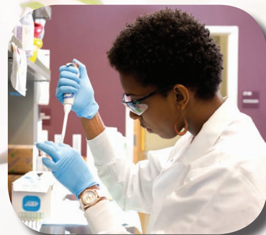
An NCCU student works in a campus laboratory.

Since 1993, the North Carolina GlaxoSmithKline Foundation has endowed more than $1,450,000 across 29 North Carolina colleges and universities to support the North Carolina GlaxoSmithKline Foundation Women in Science Scholars program