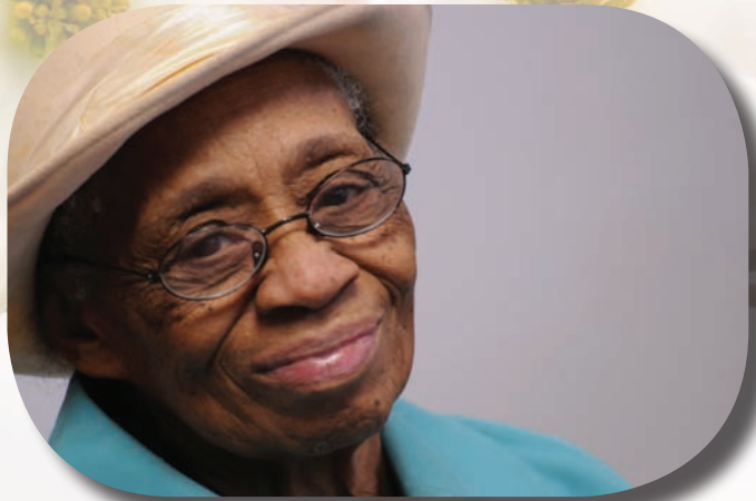
The Center is working to examine key issues affecting aging North Carolinians.

The five-year grant will be used to develop a STEM Center of Excellence for Active Learning at North Carolina A&T, with the goal of producing a diverse pool of high achieving students and staff. The project will engage faculty, nearly 5,000 NC A&T students and 60 local high school students studying science, technology, engineering and math (STEM) courses through a variety of initiatives, including course offerings, student development and summer enrichment programs. NC A&T expects the significant level of work of this STEM Center of Excellence to serve as a model for transforming STEM education not only on its campus but at institutions across the state and nation.