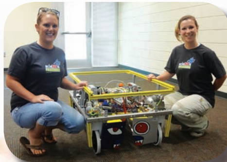
Women at the North Carolina Science

Festival with the Fayetteville library programs.