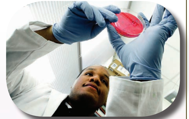
An NCCU student working in a science lab on campus.

The five-year grant will provide scholarship support for four years for 40 STEM majors, along with student and faculty support services. Students will be assigned peer, faculty and professional mentors according to their goals and interests. They will take part in a learning community, live together in dedicated residential space and obtain professional internship experiences each summer. The grant will assist NCCU in its efforts to increase the number of women and minority students who graduate with a STEM degree and pursue STEM careers.