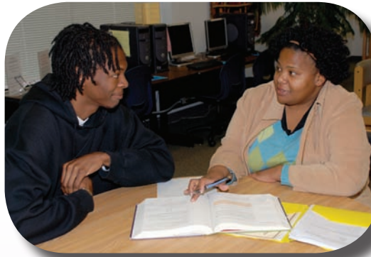
Tutoring session at Montgomery Community College.

In a county with high unemployment and 35 percent of its adult population lacking a high school diploma, reaching out with a program to boost employable life skills is critical. Montgomery Community College will use its grant to reach potential students who can benefit from its "GED to Degree" program, providing new GED enrollees with coaching, goal and career planning and, most importantly, motivational support.