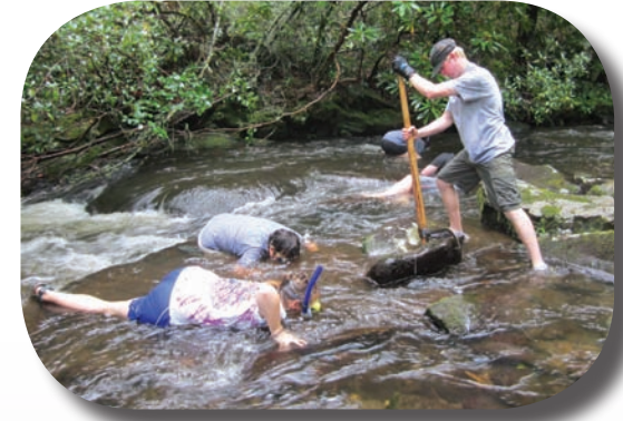
Interns search for Hellbenders through the Friends of the Great Smoky Mountains National Park.

As part of the Ribbon of Hope grant program recipients also receive customized consulting services and technical assistance from the North Carolina Center for Nonprofits. The Foundation provides the Center for Nonprofits a traditional grant annually, creating this unique relationship to provide supplementary value to all Ribbon of Hope grant recipients. The Request for Proposals and related materials are at http://www2.mcrel.org/NCGSKFRibbonOfHope/ .