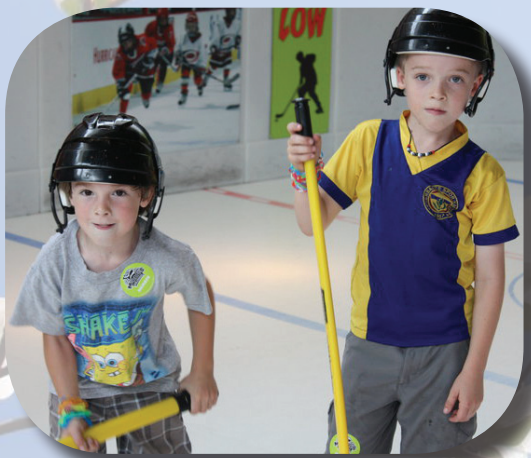
Children playing sock hockey at Marbles Kids Museum (page 5).

In recent years, much educational focus has shifted to the STEM courses of science, technology, engineering and mathematics.