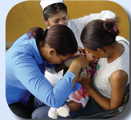
A pediatric exam at the Maternal and Child Health Clinic in Monte Plata (Project HOPE, page 8).

Total grants paid out to date as of the end of 2012 = $ 55,300,000