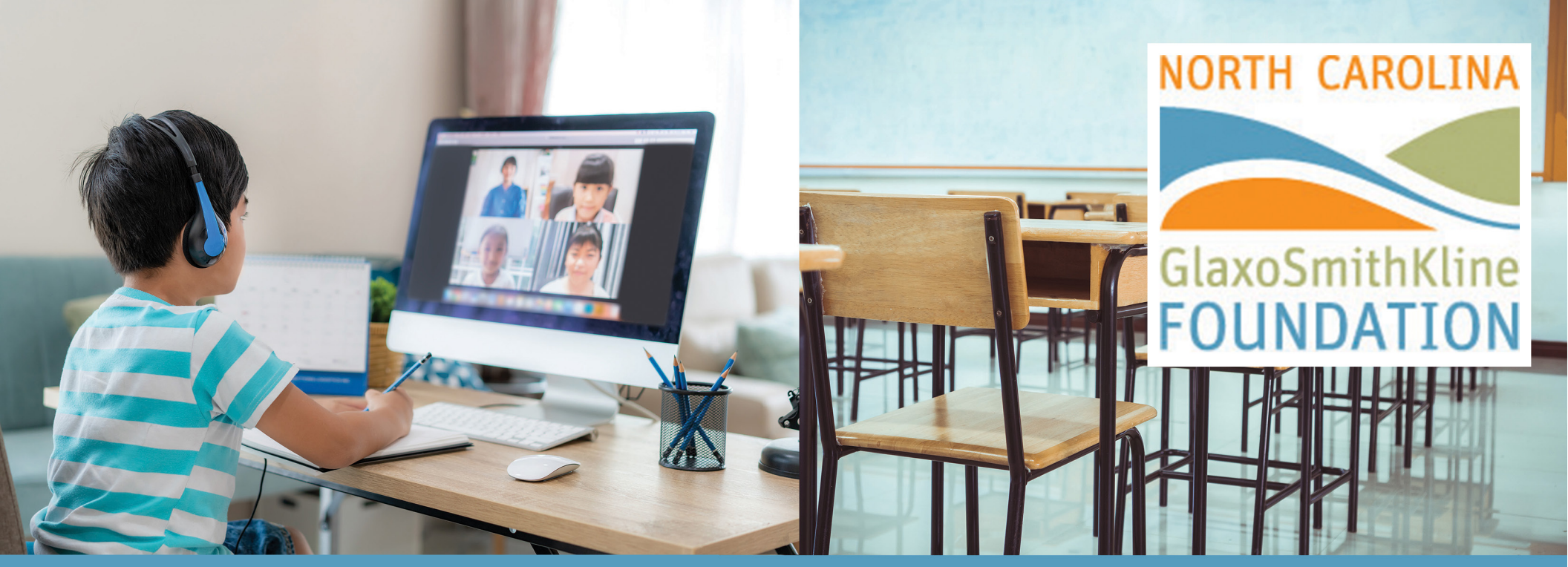
Navigating the new norm for science, health and education together.