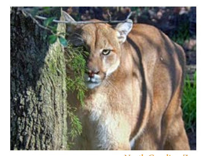
North Carolina Zoo

Faculty mentors will be recruited with an emphasis on diversity. Providing mentors that students can relate to their own backgrounds typically has the best outcomes for students. Program participants at the twelve institutions will be recruited from underrepresented students including women, minorities, first-generation and Pell eligible students. Special emphasis will be placed on mentoring students struggling with gateway courses; Calculus I and II, and Chemistry I. This mentoring program has the potential to impact over 200 STEM majors during the life of the grant.